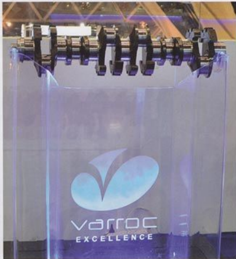
Six-cylinder crankshaft (left) will be the main component at the new Waluj plant; KTM Duke has over 20 parts sourced from Varroc.