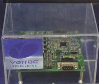
BATTERY MANAGEMENT SYSTEM

Preparing for the future: Varroc wants to be ready with products like battery management system once the electric 2-wheeler market grows in India.